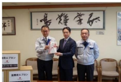
Presentation ceremony (At the City Hall main building)