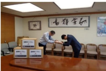
President presented the catalog to the mayor of Yokote City

The main processes involved were cutting, heat sealing, and folding the aprons. In addition to automotive seat technology, Nui Tec leveraged the experience gained from Monozukuri to pursue ease of use by healthcare workers and to select materials that feel comfortable on the skin.