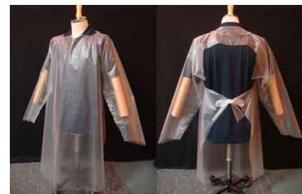
Medical apron (Overall)